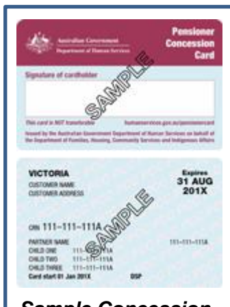
Sample Concession Card

(Some parents have just sent the form and unfortunately we cannot proceed with the application without seeing your valid concession card) You are encouraged to lodge the application form as soon as possible. Extra forms are available from the front office.